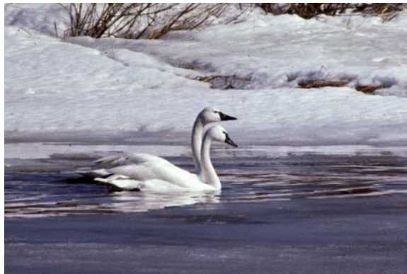
Tundra Swan Pair